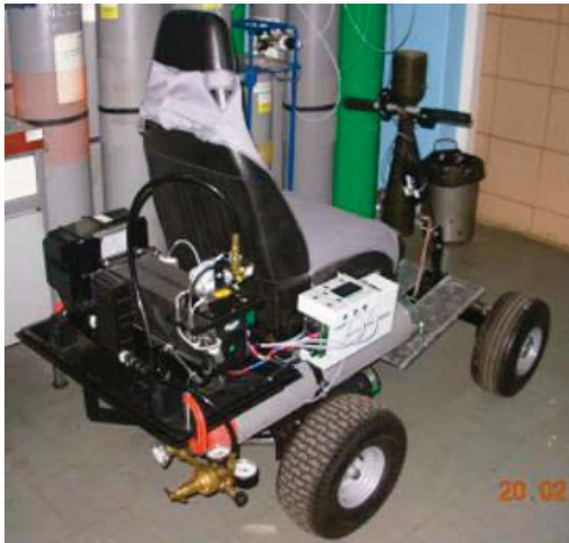
Photo. 21. Investigation of hybrid propulsion with fuel cell