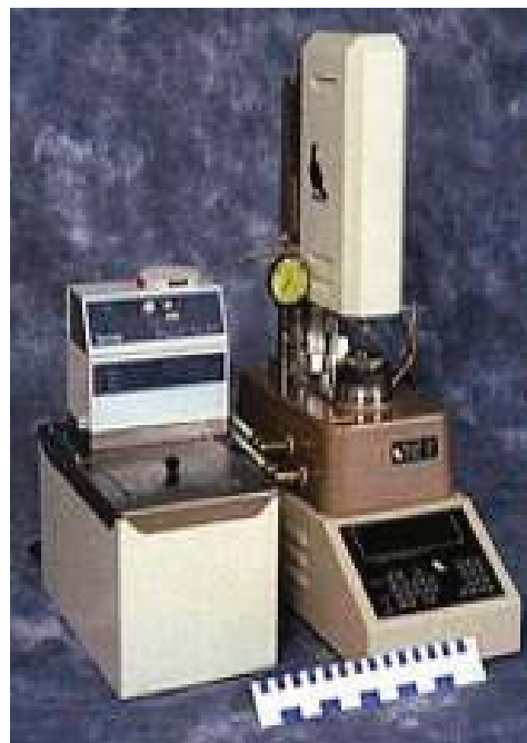
Photo. 12. Ravenfield HT/HS viscometer