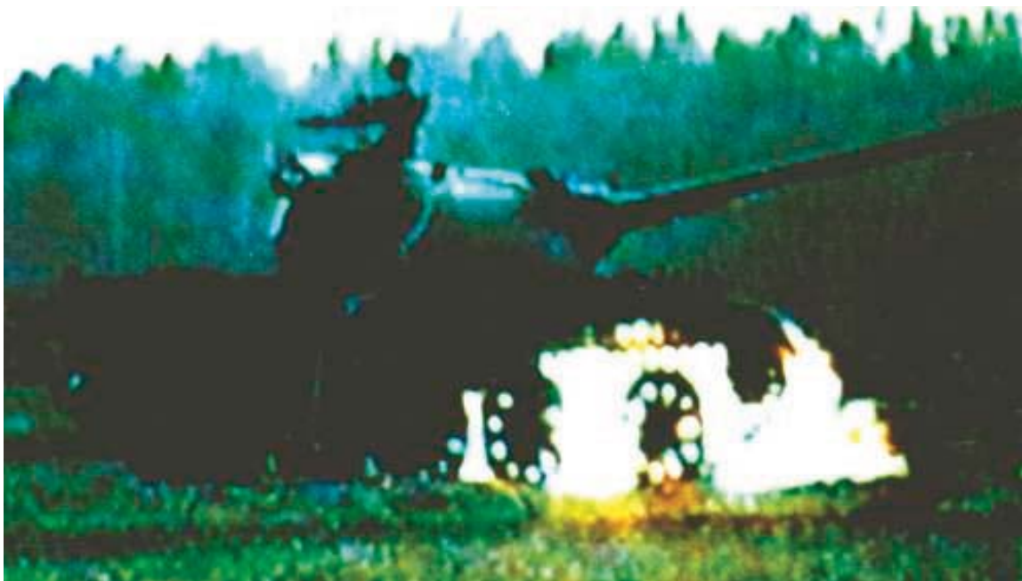
Photo. 24. Experimental examination of impact strength of tank

Investigation of impact strength of load carrying structures of combat vehicles based on FEM and computer simulation methods are realized by scientists from Department of Construction and Traffic Safety of Motor Vehicles.