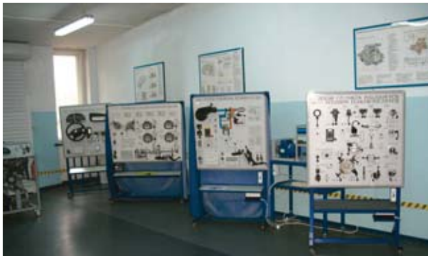
Photo. 1. Mechatronic educational equipment of motor vehicle

The example educational (and research) equipment is presented below (Photo. 1 - 12).