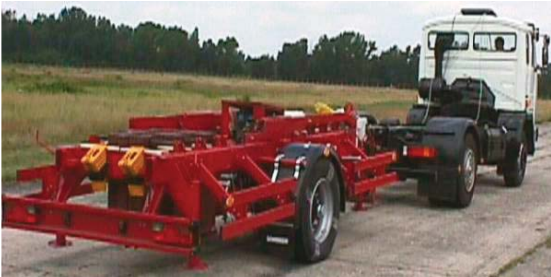
Photo. 23. Dynamometric trailer in road tests

noise emitted by vehicles. These problems are solved in Department of Construction and Traffic Safety of Motor Vehicles.