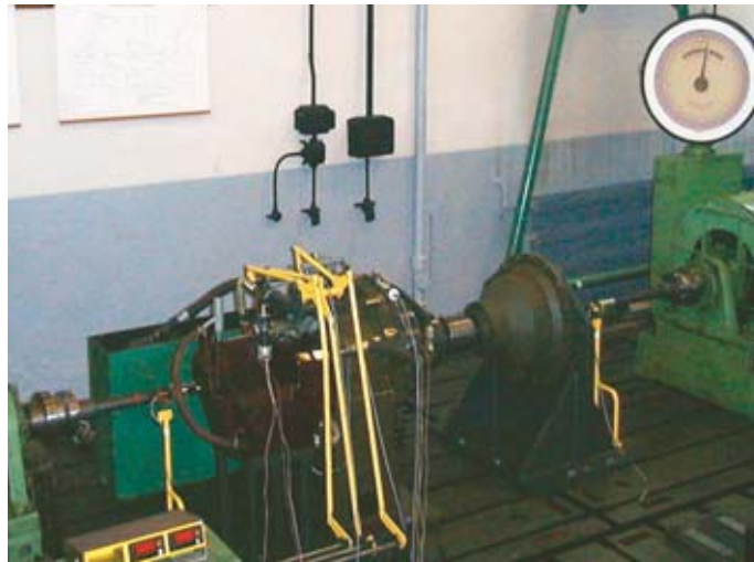
Photo. 25. Experimental-examination of dynamics of tank power transmission systems