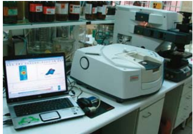
Photo. 8. Spectrometer FTIR