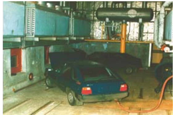
Photo. 2. The great dimension law temperature chamber