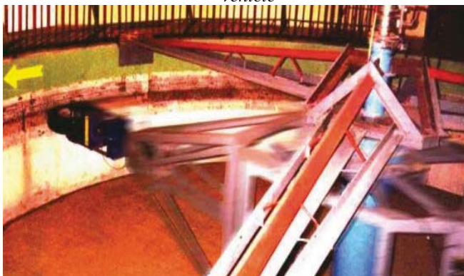
Photo. 3. Station for running wheel investigations