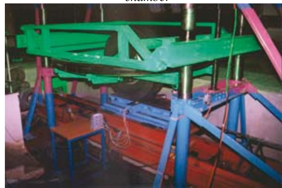
Photo. 4. Station for dynamic tests of truck tyre