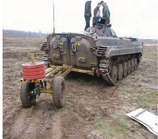
Photo. 16. Operating investigation of F-34 fuel