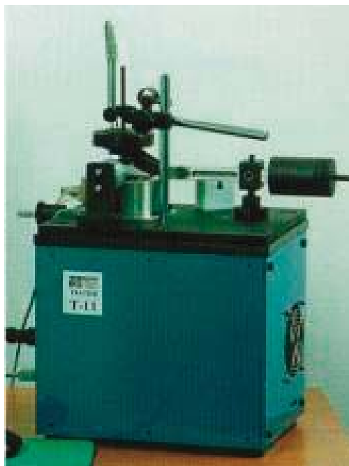
Photo. 11. Pin-on-disc wear tester