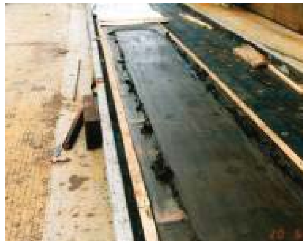
Photo. 18. Investigations of grease layer in real launching conditions