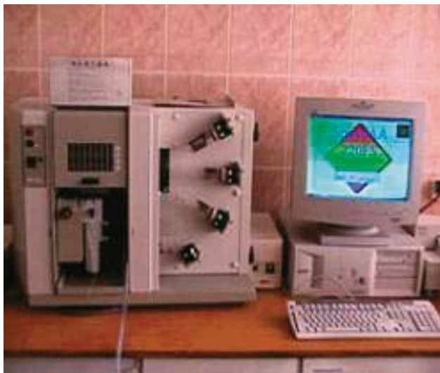
Photo. 9. Spectrometer AA