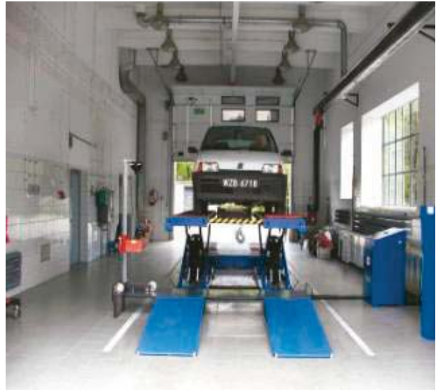
Photo. 20. Testing station with Euro 2000 diagnostic line