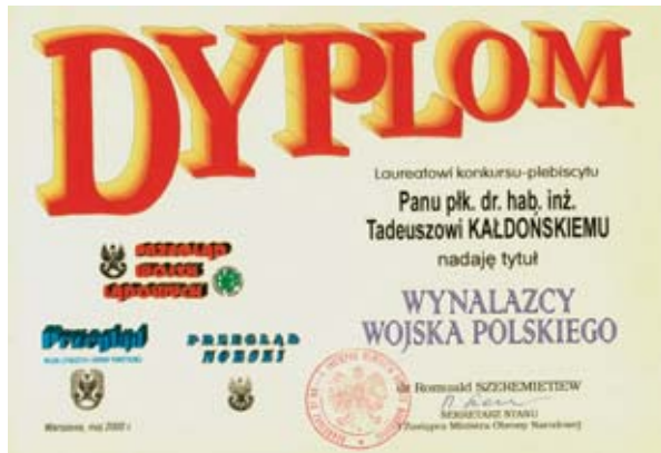
Polish Army Inventor