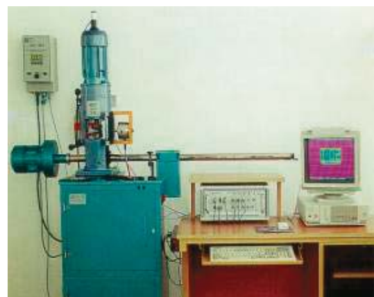
Photo. 6. Four-ball wear tester