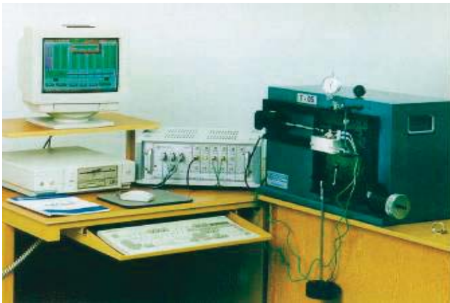
Photo. 7. Block-on-ring wear tester