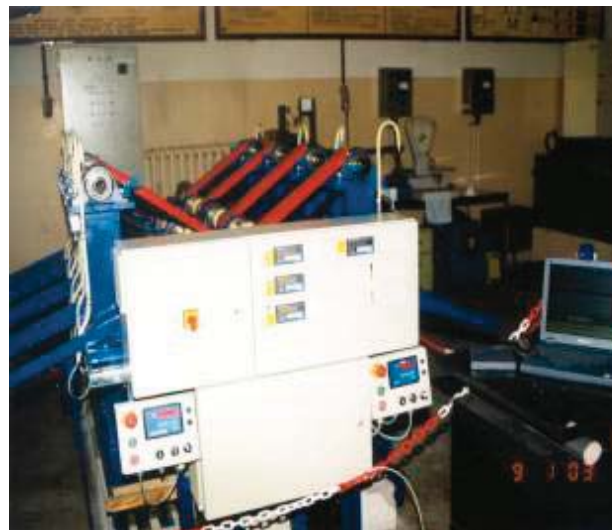
Photo. 10. Stand for investigations of self-lubricating bearings