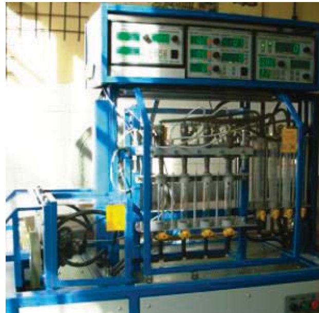
Photo. 22. Investigation of injectors with electronic control