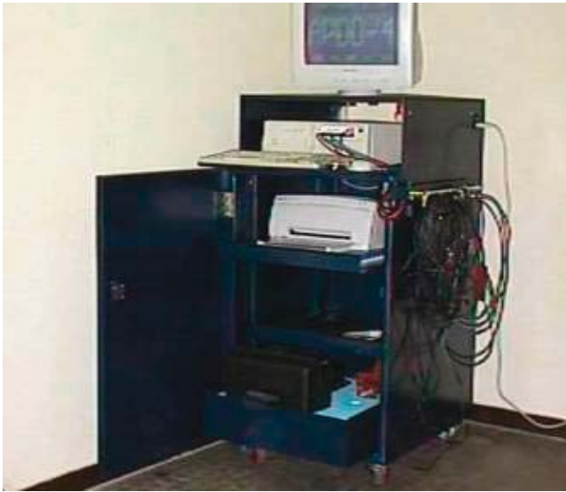
Photo. 19. Diagnostic computer set KZD-1 for Diesel engine diagnosis

covers the analysis and selection of parameters and design of diagnostic procedures and equipment geared towards process automation. These problems are solved in Department of Engines, and Maintenance Engineering of Motor Vehicles.