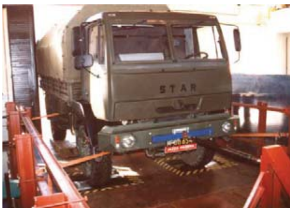
Photo. 5. Station for dynamic tests of ride cars