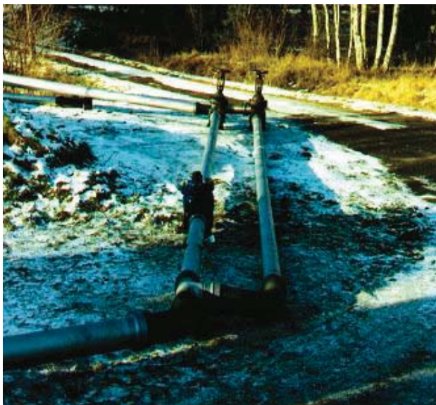
Photo. 13. Field pipeline \varnothing 150 with self-locking catch destined for fuel transportation

Fuel transportation and distribution equipment was constructed and investigated by scientists from Department of Tribology, Surface Engineering and Logistics of Maintenance Fluid, for example the new \varnothing 150 field pipeline with cone shaped quick – release snap – type connectors (two Polish patents).