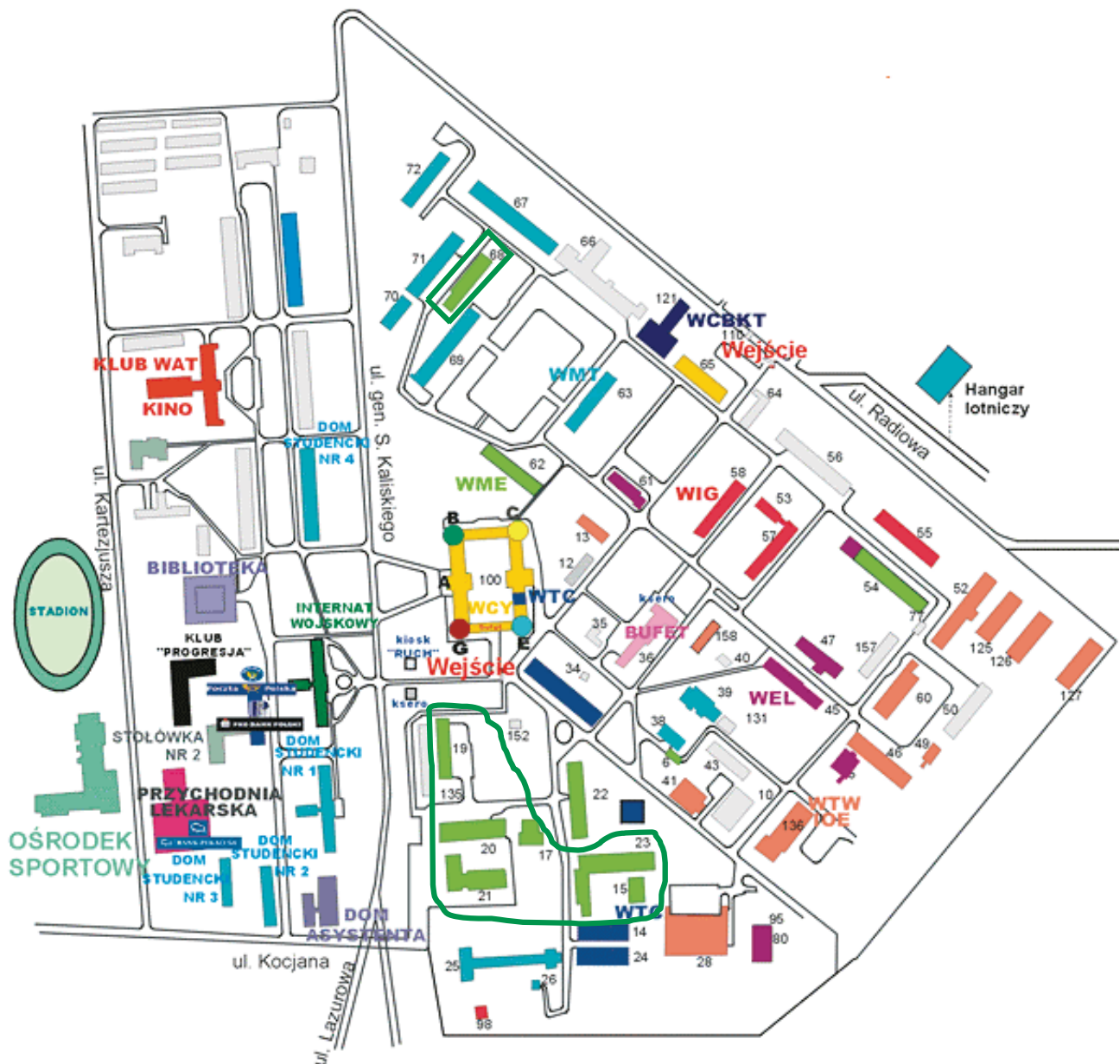
Fig. 1. The general plan of Military University of Technology and localization of Institute buildings (green line)

At present, the educational and research equipment of the Institute is placed into 8 buildings. There are, among others, 15 lecture rooms and 35 department laboratories. Moreover on institute region are the repair shop of vehicles, motor school and two diagnostic stations of motor vehicles. The localization of Institute buildings on the plan of Military University of Technology and the current structure of the Institute are presented below (Fig.1, Fig. 2).