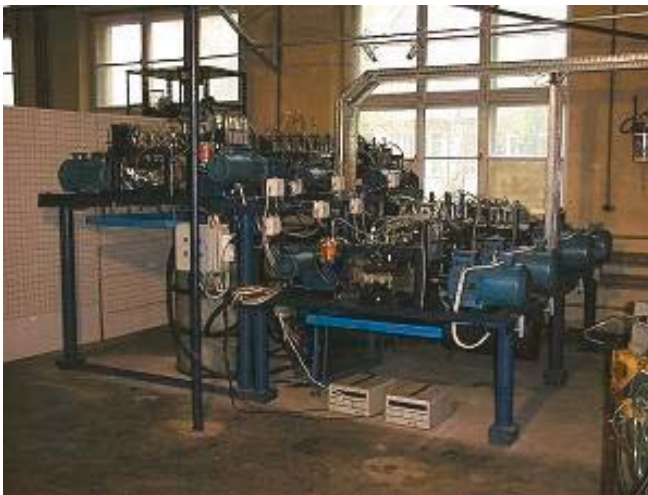
Photo. 15. Durability of injection systems investigation stand