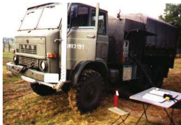
Photo. 14. Self-propelled pump station cooperating with field pipeline